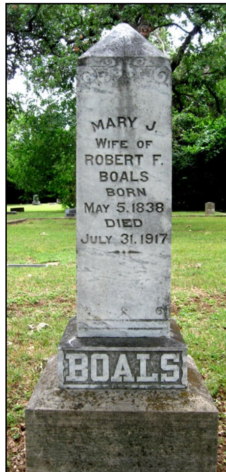
Headstones at old Arlington Cemetery