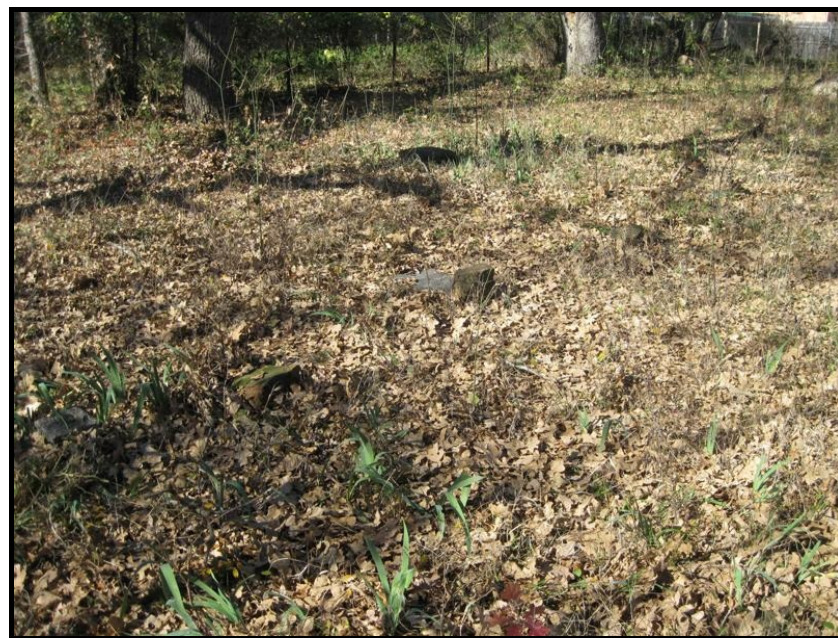
If it were not for the historic marker, one may never notice this cemetery at the side of the road. A few field stones and fewer headstones are all that are found.