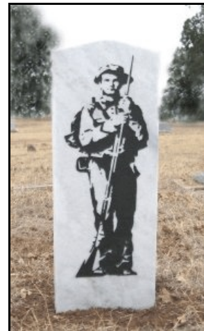
Back of George's headstone at left